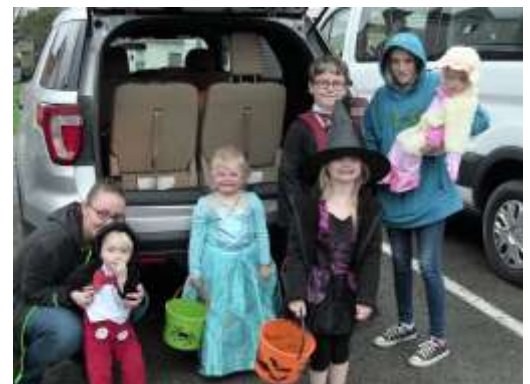
Trunk or Treat 2017