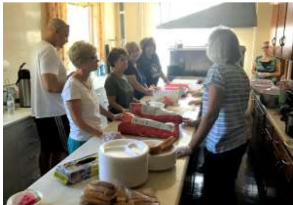
Volunteers from our church help out with the "Common Ground" food service on July 7th.